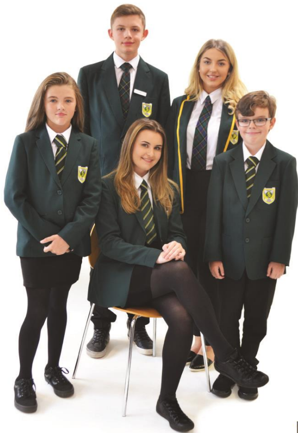
St John Ogilvie High School